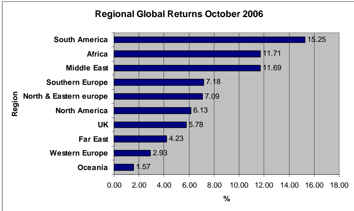
Chart 1: Global Returns by region October